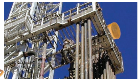
Ideal For Finger Board Cooling